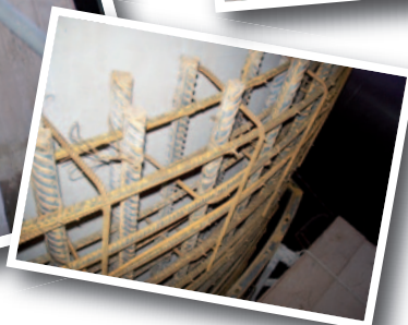
Design and construction of a new opening in an old concrete stack for a glass plant in Belgium. Reinforcement of the stack shell and of the brick lining.