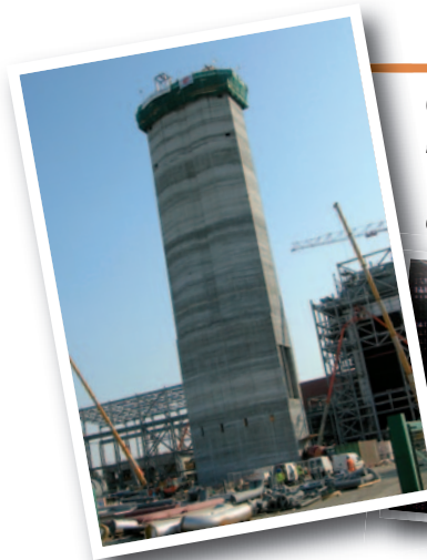
Construction of a 100m high concrete stack with two internal steel liners for a new power plant in Italy.