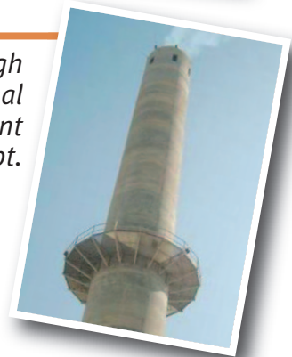
Design of a 135 m concrete stack with two steel liners for a power plant in Brazil.