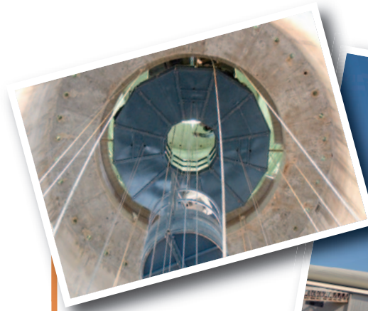
Execution of a 100 m high concrete stack using a slipform for a float glass plant in the state of São Paulo (Brazil). On the left, internal working platform for the brick lining erection.

Important chimneys are mainly having a concrete windshield. They can be single flue or multiflue. The internal liners can be made of various materials, such as carbon or stainless steel, Fiber Reinforced Plastic (FRP), bricks, refractory, borosilicate... to cover different types of operating conditions.